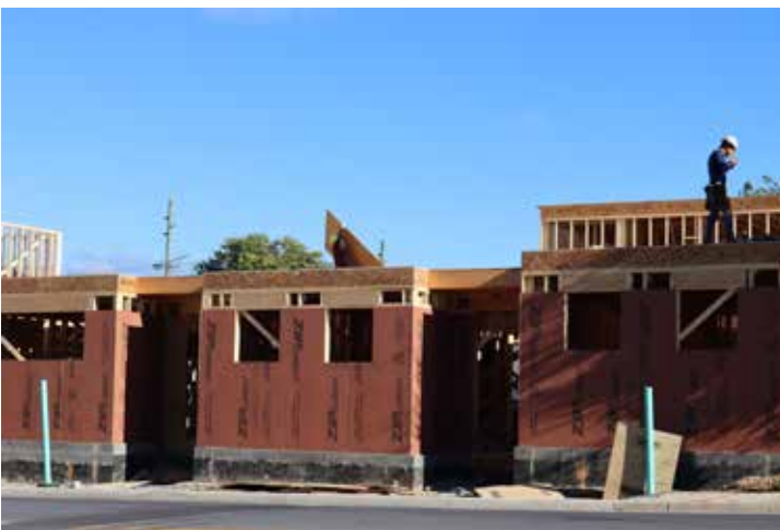
Top and bottom: Various stages of the construction progress on Piccadilly Street.

Trex Corporation's moved 200 employees into a new corporate headquarters in the City of Winchester, resulting in a roughly $15 million investment.